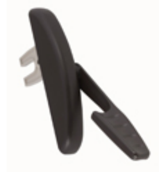
Euro Contour™ Lock

The Contour™ lock maintains a longer handle and is cleverly designed to meet ADA requirements. Increased travel allows up to 8 lock points on casement sash sizes ranging up to 102" (2,591 mm) tall. The lock drive interfaces with standard euro groove lock points and keepers. Our Euro Contour™ operator has increased load carrying capacity and 22% more operating leverage for ease of operation. Operator slides are designed to use the euro groove for ease of installation. All Euro Contour products have an integrated gasket to maximize weather resistance around each hardware location. CHIC hinges provide 220 lb sash weight capacity with concealed styling and full adjustability.