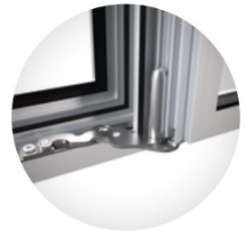
CHIC Concealed Hinges

We've built a reputation designing hardware.