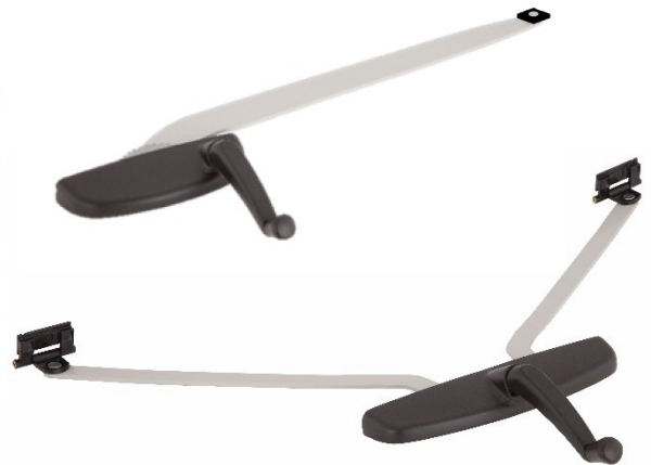
Euro Contour™ Operators

Secure your sash with hardware you trust.